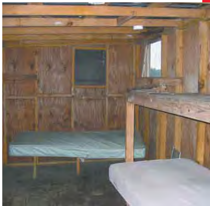
Guestworkers who had jobs picking tomatoes in South Carolina lived in this “house” in 2005.

These are not isolated cases. Time and again, advocates for guestworkers hear these stories. •