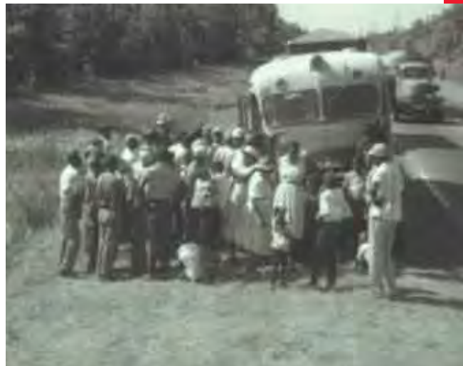
The documentary "Harvest of Shame," broadcast by CBS in 1960, called America's attention to the callousness with which U.S. agricultural giants treated migrant farmworkers.

The DOL's wage and hour division had earlier documented what it called "a woeful history of labor violations," including unsafe living and working conditions and wage abuses. Yet the forestry contractor continued to receive permission to import guestworkers. When the DOL's Employment and Training Administration refused to cancel guestworker services to this employer, North Carolina's monitor advocate, a state official who is supposed to enforce farmworker rights, filed a complaint with the DOL's inspector general. A year and a day after the filing of that complaint, 14