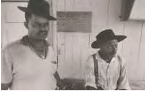
Labor organizers in the 1950s exposed widespread abuses of migrant farmworkers.

that Mexicans, who had been deported en masse just a few years earlier, were easily returnable. 6 This program was designed initially to bring in a few hundred experienced laborers to harvest sugar beets in California. Although it started as a small program, at its peak it drew more than 400,000 workers a year across the border. A total of about 4.5 million jobs had been filled by Mexican citizens by the time the bracero program was abolished in 1964.